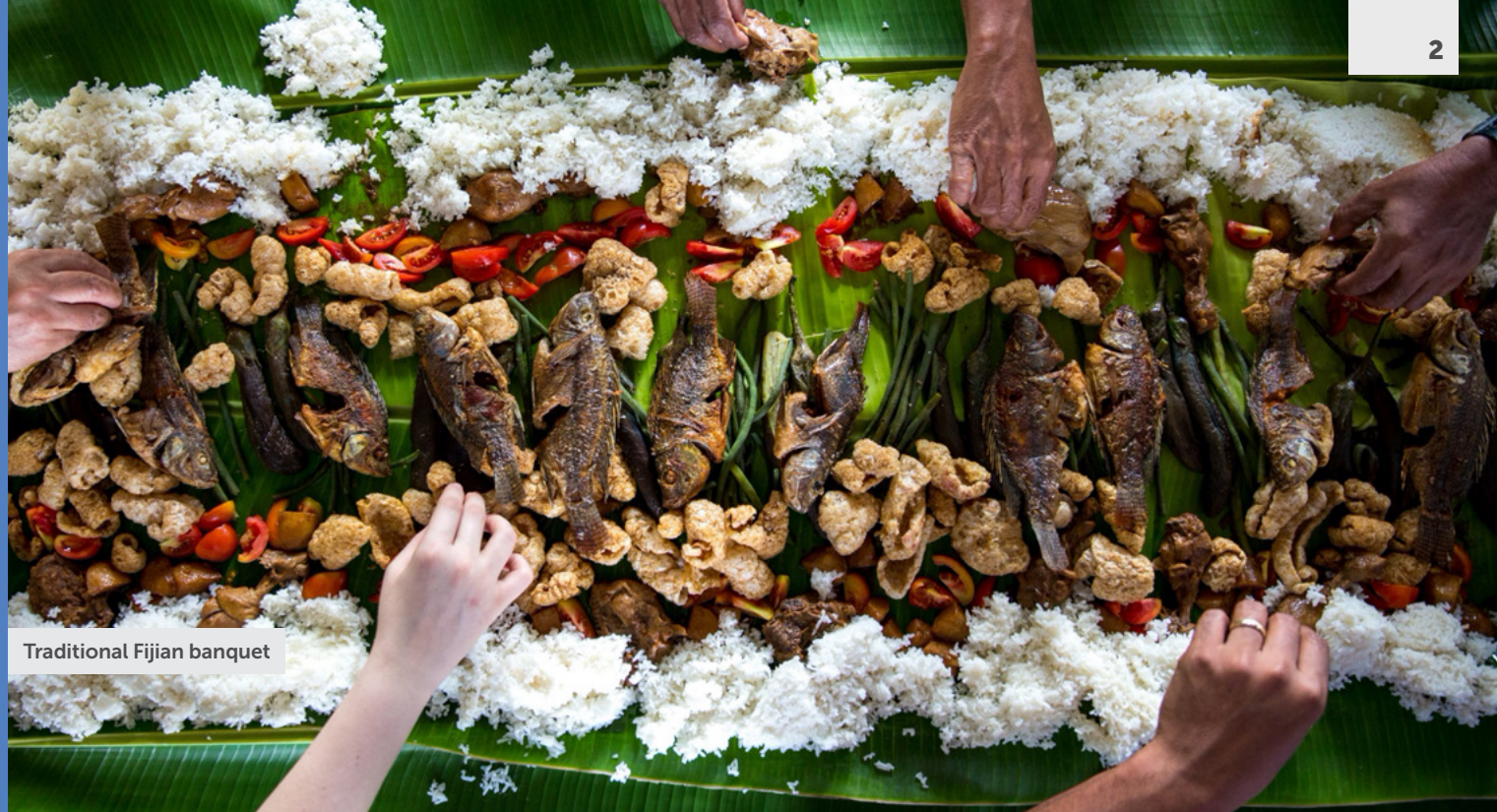
Traditional Fijian banquet