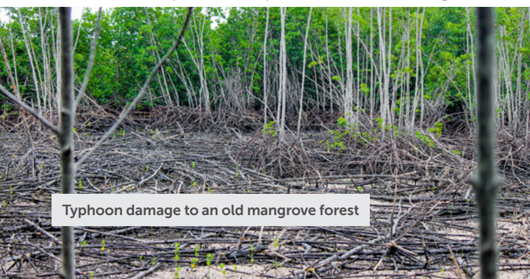
Typhoon damage to an old mangrove forest

Across the Pacific, women continue to play key roles in agriculture and fisheries sectors; however, they tend to be undervalued and underrepresented actors in agriculture and fisheries development and decision-making. 9 This underrepresentation means that typically unheard voices in crucial industries go ignored, exacerbating inequalities.