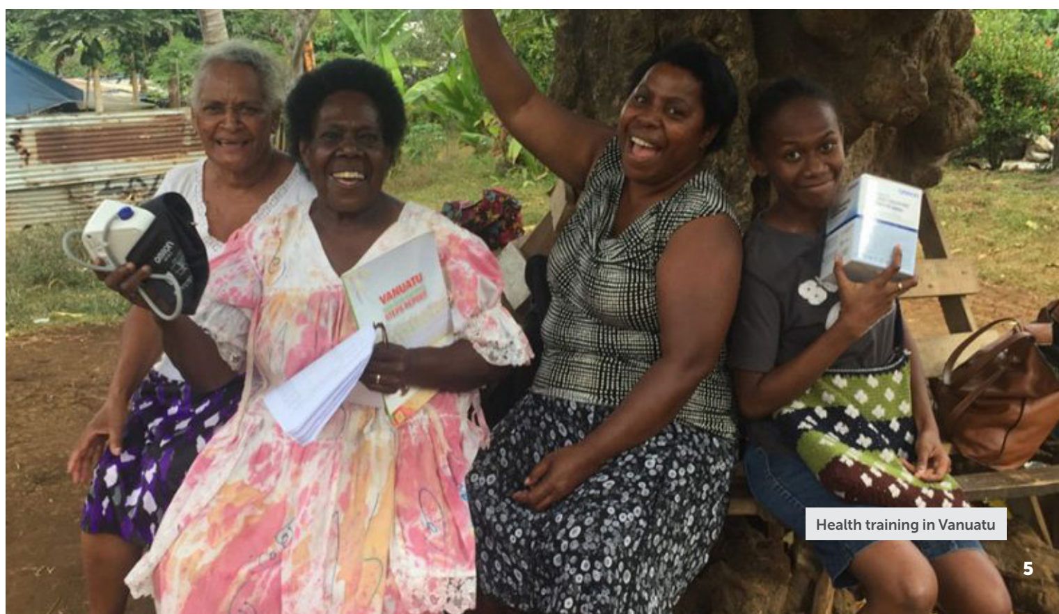
Health training in Vanuatu