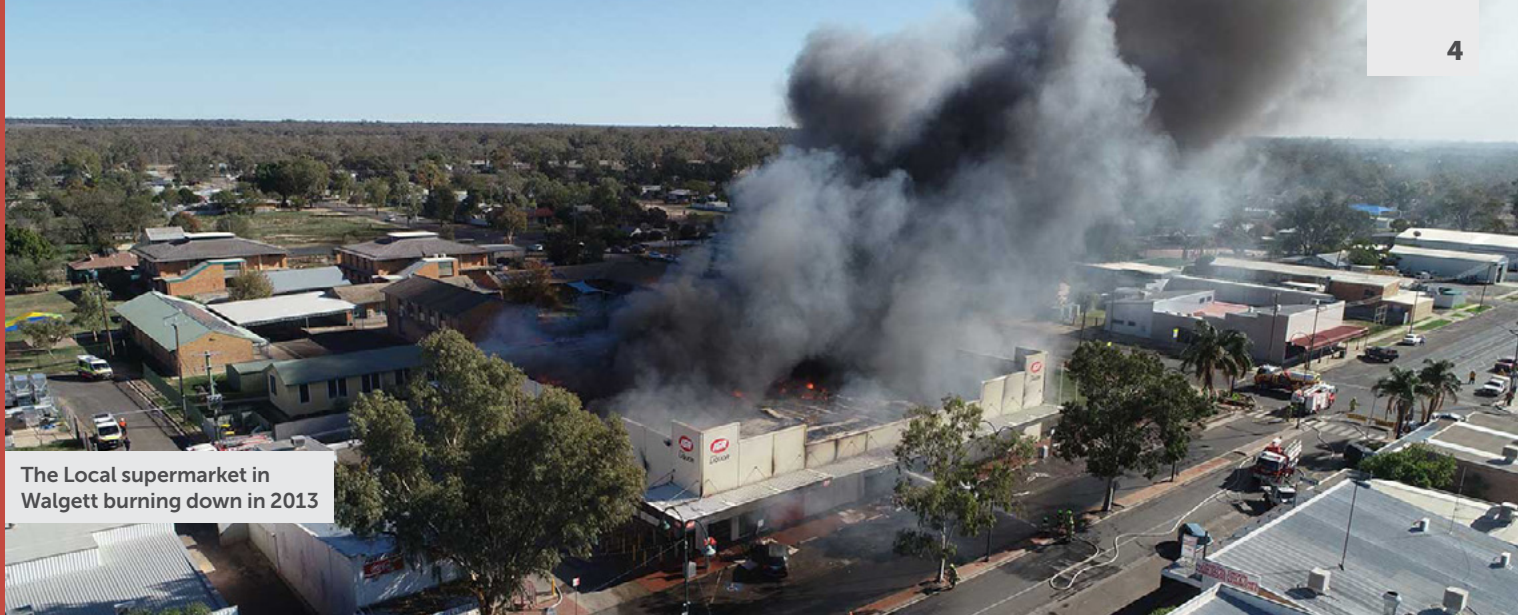
The Local supermarket in Walgett burning down in 2013

Access to food has been further disrupted by the COVID-19 pandemic, when panic buying in cities plunged remote areas into severe food shortages. Efforts to maintain stock on city supermarkets shelves in response to increased demand dramatically reduced supplies available for remote areas. The temporary supermarket – Walgett IGA – reported only 26% of the stock it ordered during the height of the first wave of the pandemic. Families were going hungry on consecutive days and with schools closed, children were no longer receiving food provided by the breakfast program and school canteens. 3, 8