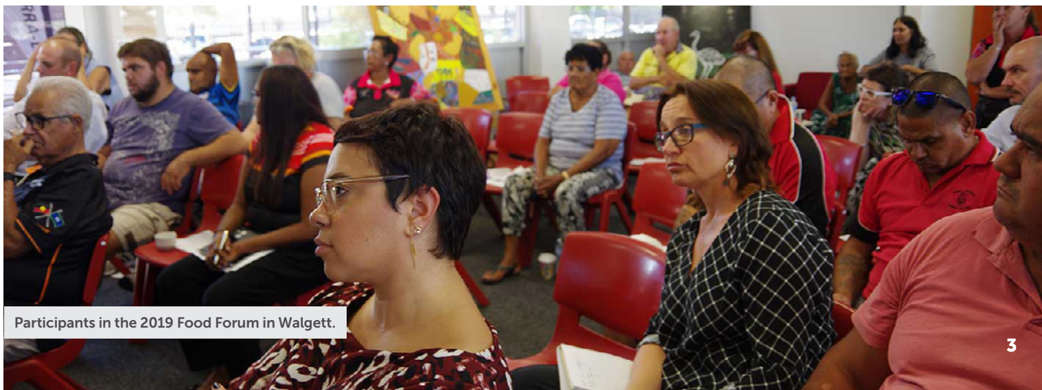
Participants in the 2019 Food Forum in Walgett.

Walgett has one supermarket and a small selection of cafes, restaurants and take-away outlets. The local supermarket has burnt down twice in the last decade. This led to residents having to travel 80 kilometres to the next closest supermarket, rely on emergency food relief or a very limited temporary supermarket, or frequently purchase take-away foods. 3, 8