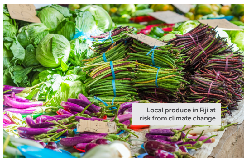
Local produce in Fiji at risk from climate change