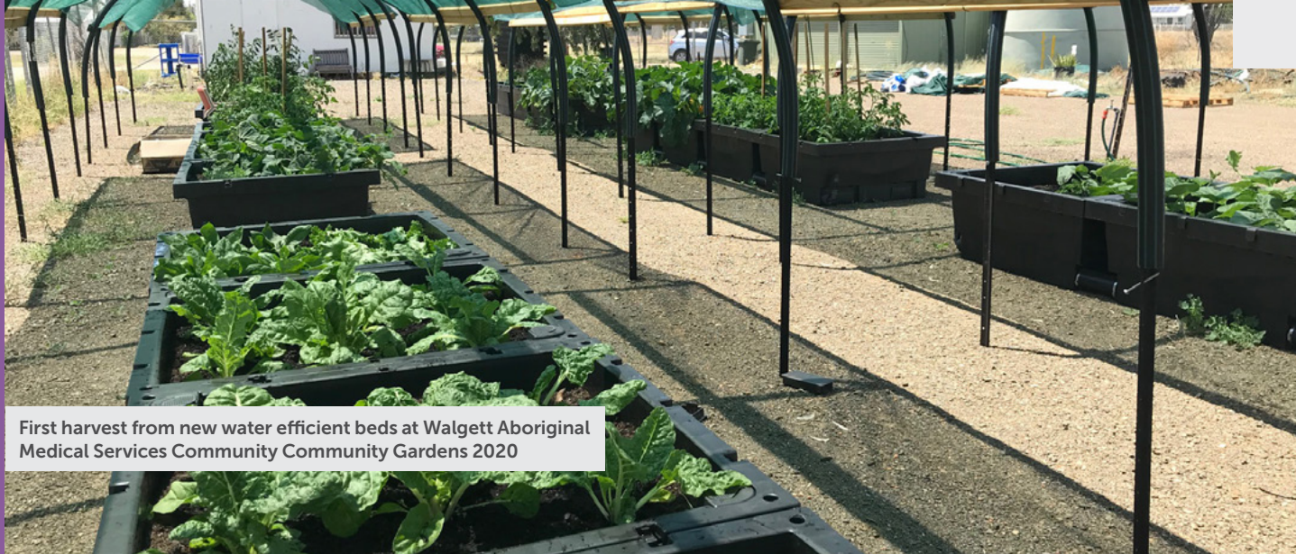
First harvest from new water efficient beds at Walgett Aboriginal Medical Services Community Gardens 2020

degree on healthier, more sustainable and equitable food systems'. 1 Dubbed 'the People's Summit', it calls on people of the world to: 'work together to transform the way the world produces, consumes and thinks about food'. 1 Summit organisers and stakeholders developed five Action Tracks to focus discussions. The Action Tracks were designed to address possible trade-offs with other tracks, and to identify solutions that can deliver wide-reaching benefits in food systems.