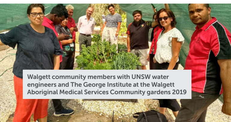
Walgett community members with UNSW water engineers and The George Institute at the Walgett Aboriginal Medical Services Community gardens 2019

The Program operates within a collective and relational team dynamic that places Aboriginal and Torres Strait Islander voices and knowledge at the centre of the research process. This decolonised space involves unpacking colonial practices that have created