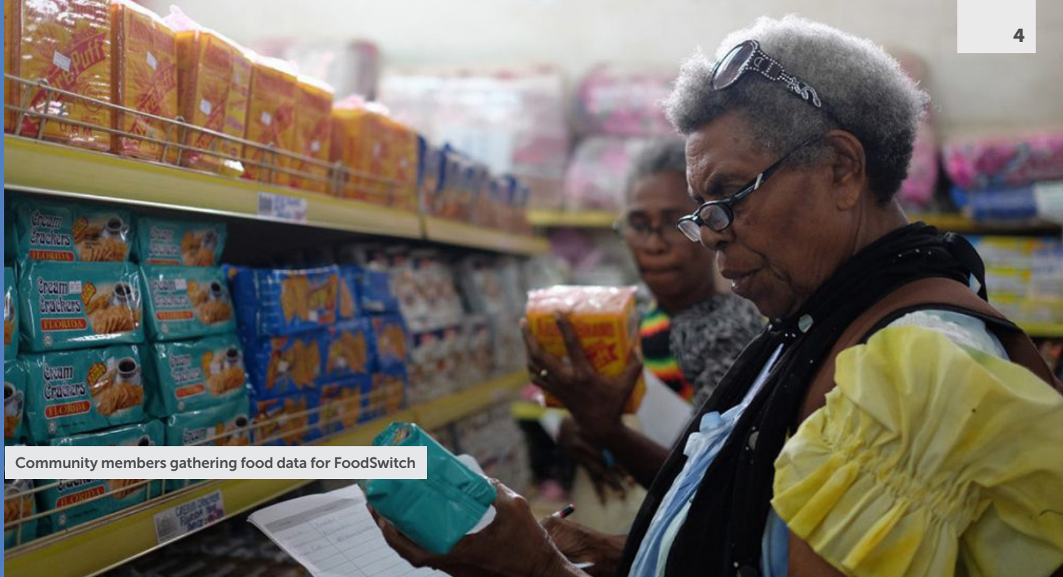
Community members gathering food data for FoodSwitch

“The COVID-19 pandemic in our region has threatened our livelihood, compounded poverty, insecurity with social and health inequities”